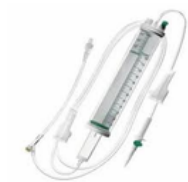
Measure Volume Pediatric set with bulb latex (150ml)