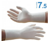
Sample Surgical gloves ( Size 7.5)