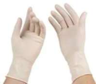
Examination gloves (Latex powdered)