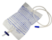
Urine Bag 200ml